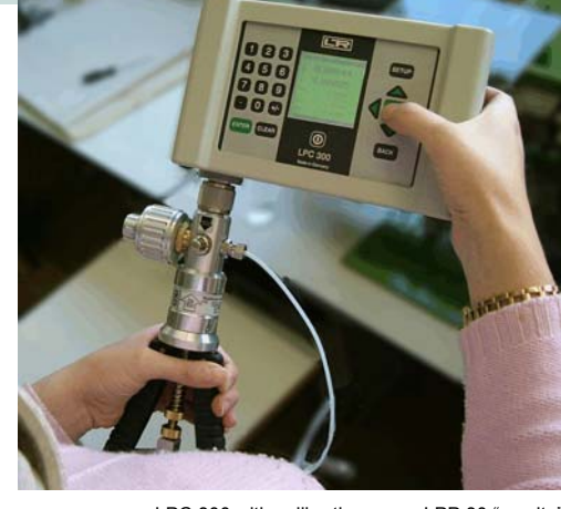
LPC 300 with calibration pump LPP 30 "on site"