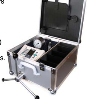
Pressure comparison pump LSP 1000-K

are compatible with stainless steel 1.4571