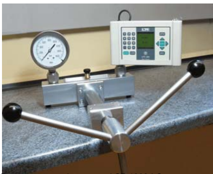
ressure comparison pump LSP 1000-LC

In "measuring" operation, the LPC 300 displays simultaneous: